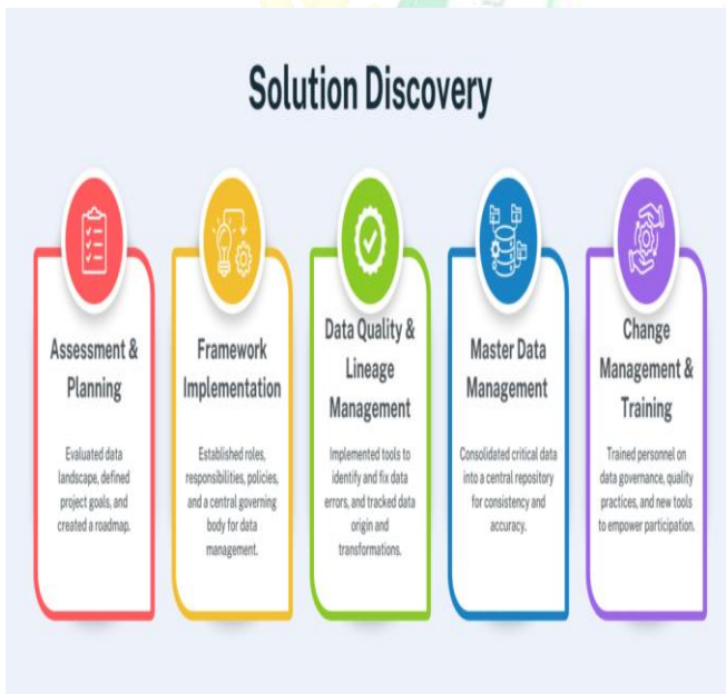
Fig. 2:

Despite growing literature on data governance and financial reporting, limited studies have examined the application of governance frameworks in Voltron Data Mart environments . Most existing research focuses on traditional ERP or BI tools rather than emerging data marts with governance-first architectures. This gap justifies the need for a focused study on how Voltron Data Mart can