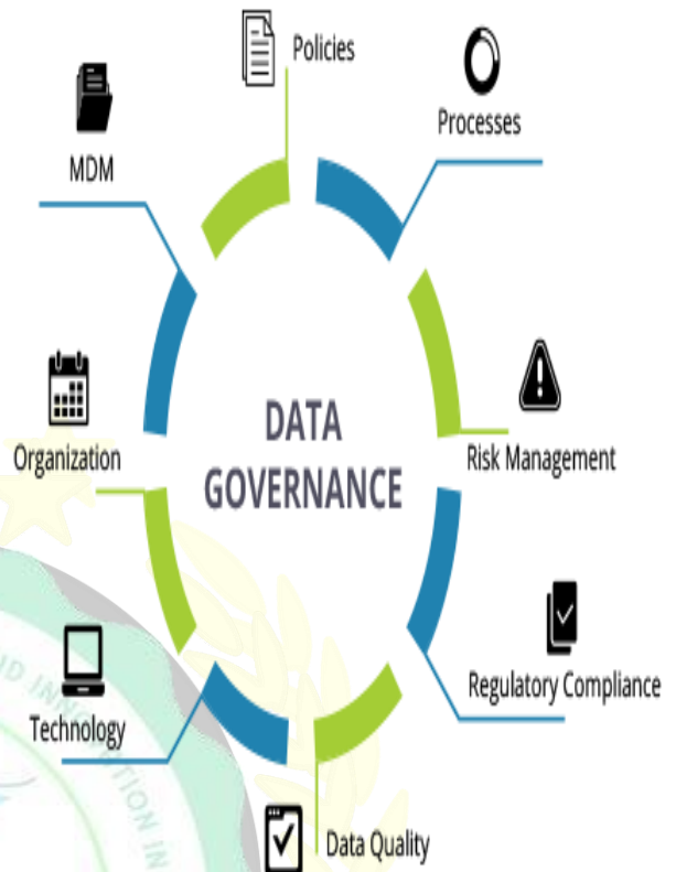
Fig.1: Source: linkedin.com/pulse/data-governance-banking-industry-deebhan-m

The globalization of financial markets, along with regulatory reforms and increased stakeholder expectations, has amplified the importance of accurate and transparent financial reporting. Organizations rely heavily on financial reporting systems to consolidate data from diverse sources, perform reconciliations, and produce reports aligned with international standards such as the International Financial Reporting Standards (IFRS) and Generally Accepted Accounting Principles (GAAP). Despite advances in reporting tools, many enterprises face persistent challenges: inconsistent data quality, fragmented data silos, compliance lapses, and limited traceability.